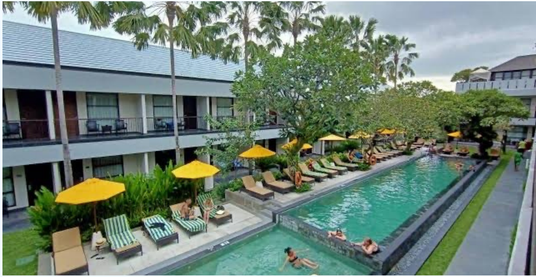
Seminyak: Amadea Resort & Villas